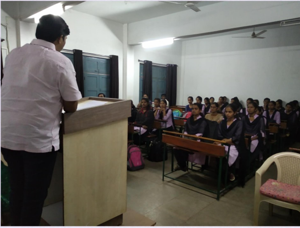
Hon. Nilesh Yesugade Delievring Lecture